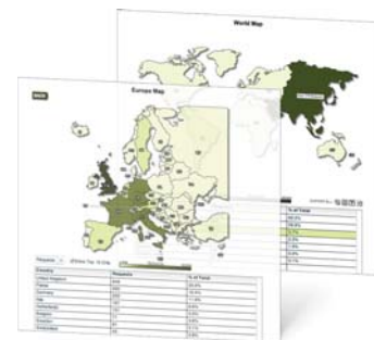
Color-coded Geo Reporting maps make it easy to identify geographies with top activity.

Now you can monitor the performance of your website with Gomez, the industry's leading solution for web experience management. Because performance testing and measurement include the impact of your users' access networks, metrics from Gomez get you one step closer to the actual user experience. Thanks to close integration with LimelightCONTROL X, you can request hourly end-point performance testing and measurements for your selected region. Measurement graphs are delivered directly to you via a daily email from Gomez.